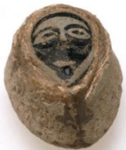
9 th century lead weight found during the Woodstown excavations on display in Reginald's Tower

Help raise much needed funds for the conservation of objects.