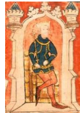
Detail of Great Charter Roll 1372 showing King Edward III on display in the Medieval Museum

Bite-size culture , a 15-minute spotlight on a great treasure of Waterford. Every Wednesdays throughout 2014 @ 1.15pm.