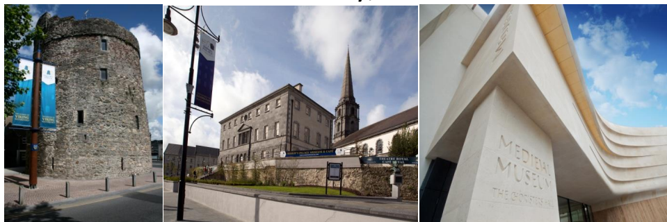
Reginald's Tower, Treasures of Viking Waterford Bishop's Palace, Treasures of Georgian Waterford Medieval Museum, Treasures of Medieval Waterford