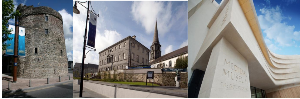
Reginald's Tower, Treasures of Viking Waterford Bishop's Palace, Treasures of Georgian Waterford Medieval Museum, Treasures of Medieval Waterford